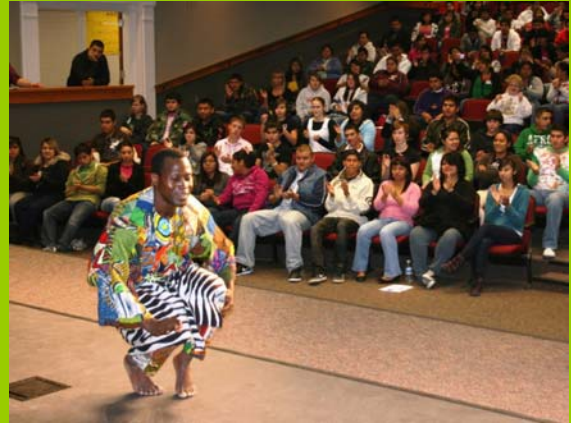
Yakima Valley Community College, September 2009