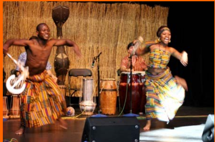
Spirit of West Africa Festival May 2009