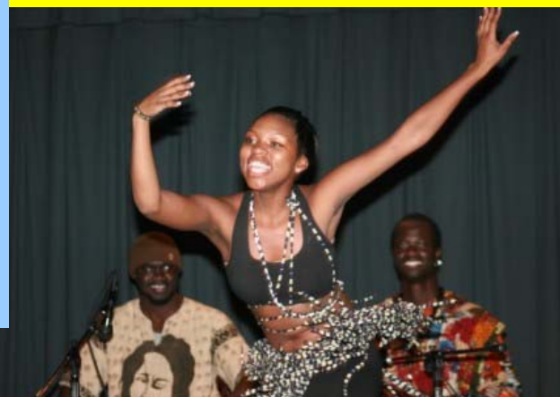
Third Place Commons World Music Festival October 2009

Traditional dance from Benin is featured, including Vodoun ritualistic dances, regional social ceremony dances, such as the Chenkoumé dance from Savalou, and royal historical dances such as the Zehli dance from the late 1800's. Live kora (21-string harp), djembe (drum) and percussion accompany modern dance arrangements based on traditional movement and rhythms while costumes from West Africa provide color and cultural context for the dance.