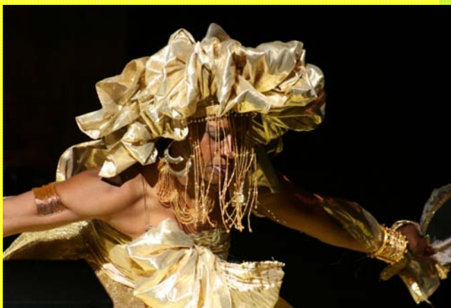
Spirit of West Africa Festival May 2009

On stages of all sizes, for audiences of all ages, Gansango showcases the vibrancy of African music and dance