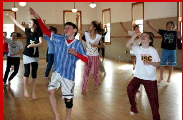
Centrum - residency for middle school students 2008, 2009