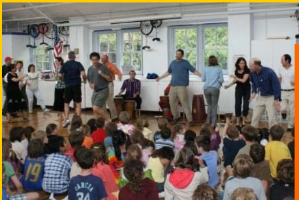
The students' favorite part is seeing their teachers get up and dance! The Meridian School May 2008