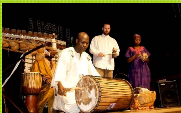
Performance for children Ridge Romp March 2008

Contact us now to book a show or a residency for 2010 or 2011! Email: gansango@yahoo.com