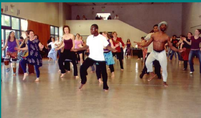
Workshop in Traditional Beninese Dance Seattle World Rhythm Festival 2003