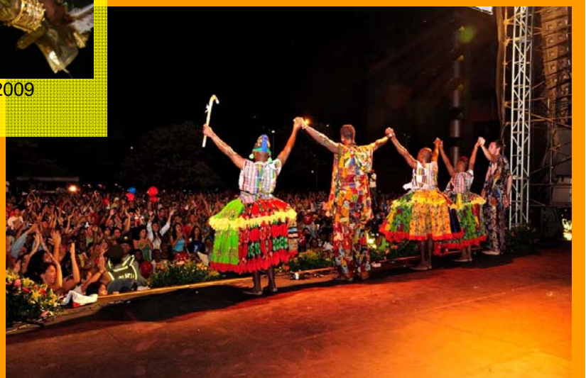
La Negra Noche, Medellin, Colombia August 2009

On stages of all sizes, for audiences of all ages, Gansango showcases the vibrancy of African music and dance