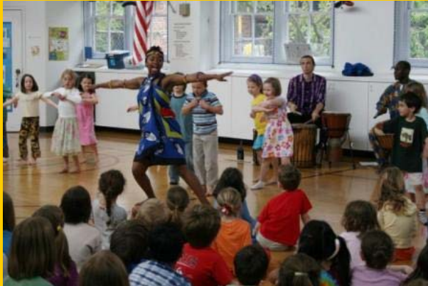
We invite some volunteer students to try out African dance moves