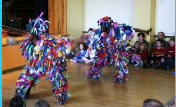
Performances for children & families