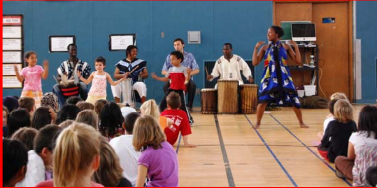
Alki Elementary School May 2009