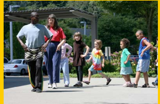
Workshops for youth through libraries & schools