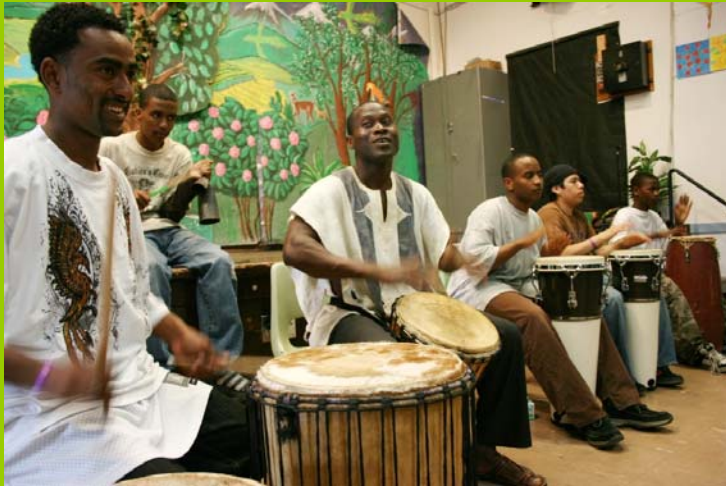
Rhythm & Moves: Year-long residency at Seattle's World School (SBOC) 2008 & 2009

Versatile and skilled instruction for all ages - We make learning fun